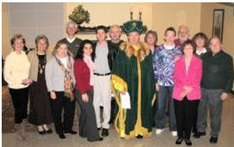
12th Night/Newcomers' Party with "King Wenceslas"